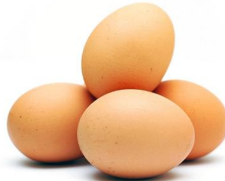
Raw eggs – Egg Yolk only - ones or twice a week