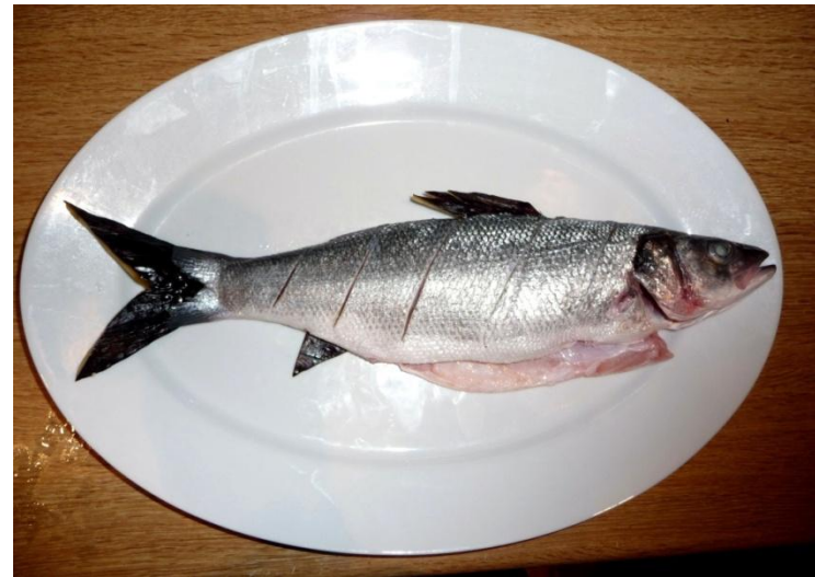
Raw fish – fresh and cleaned of bones, ones a week