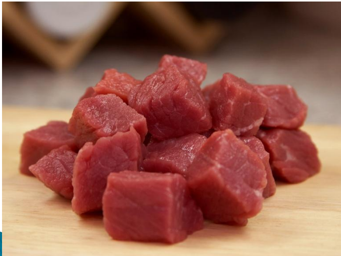
Raw beef – lean and fresh, cut in pieces.